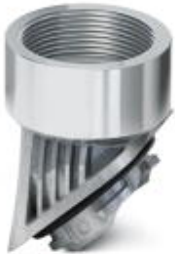
Adapter, aluminum, for EVO housing, Pg 29 thread

Please be informed that the data shown in this PDF Document is generated from our Online Catalog. Please find the complete data in the user's documentation. Our General Terms of Use for Downloads are valid ( http://phoenixcontact.com/download )